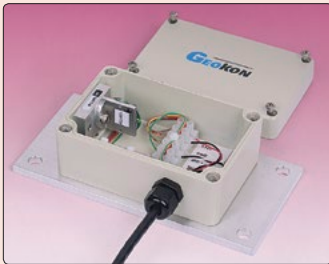
• Model 6161A-1 Uniaxial MEMS Tilt Sensor with cover removed.