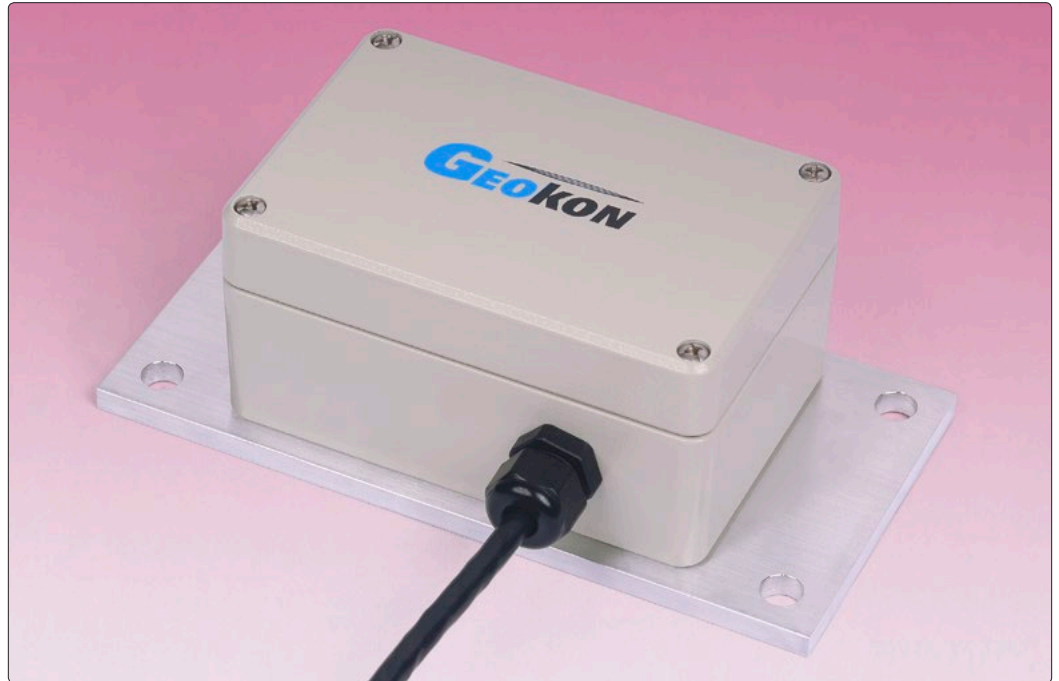
• Model 6161A-1 Uniaxial MEMS Tilt Sensor in NEMA 4 enclosure.