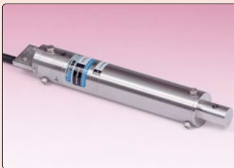
• Model 6160A-2 Biaxial MEMS Tilt Sensor.