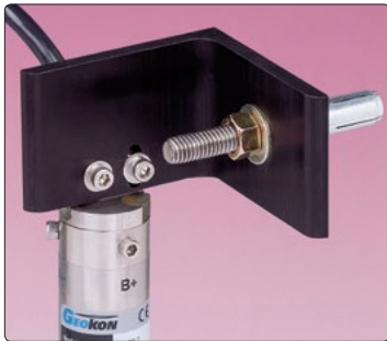
● Closeup of Model 6160A-2 Biaxial MEMS Tilt Sensor mounting bracket assembly.