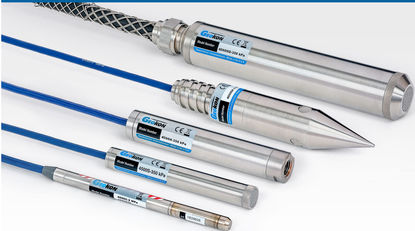
Front to back Model 4500C, 4500S, 4500H, 4500DP and 4500HD Vibrating Wire Piezometers (front to back).