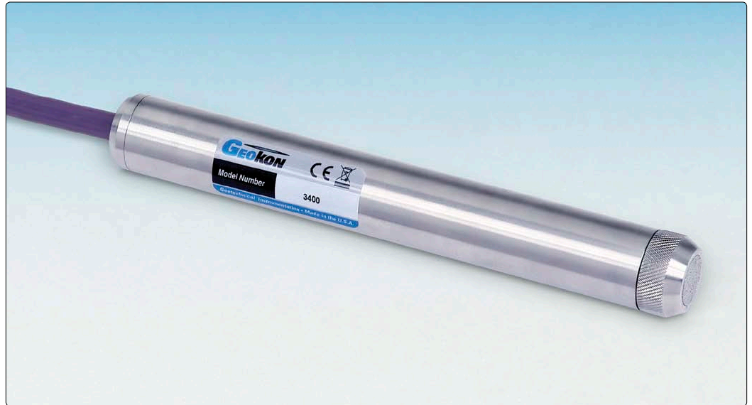
• Model 3400 Semiconductor Piezometer.