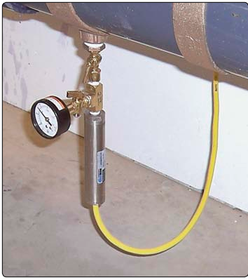
• Model 3400 and Dial Gage Pressure Transducer on a tee fitting.